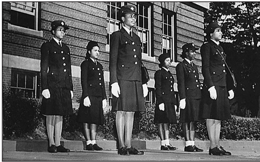
Members of the 1943 Cardozo High School Victory Corps in Washington stand at attention. Washington didn't begin desegregation until the 1950s.

The barriers began to break down in the years after World War II, but slowly.